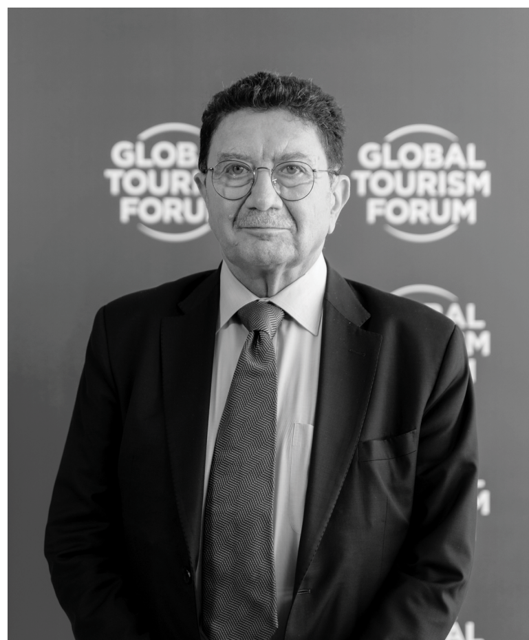
Taleb Rifai Secretary General of WTFI