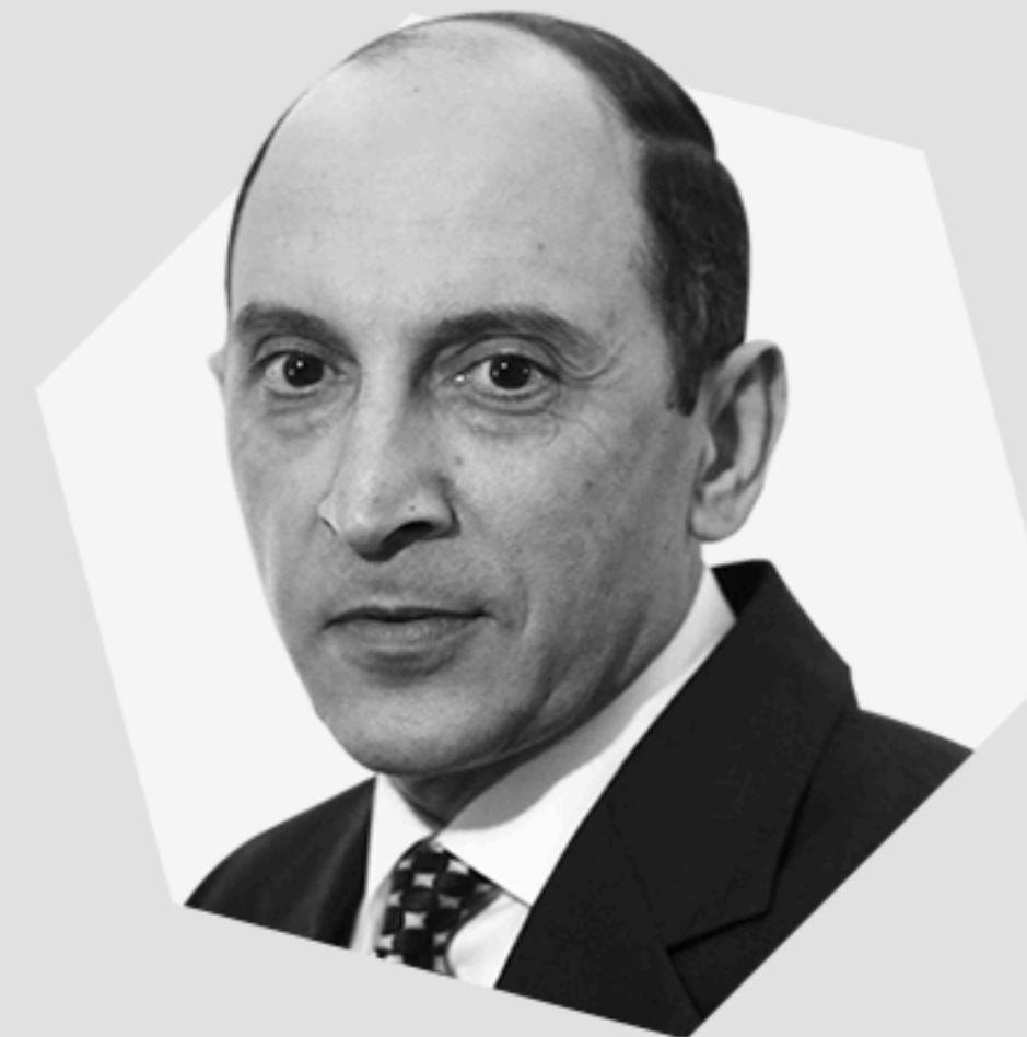
Akbar Al Baker

Group CEO of Qatar Airways, Secretary-General of Qatar Tourism